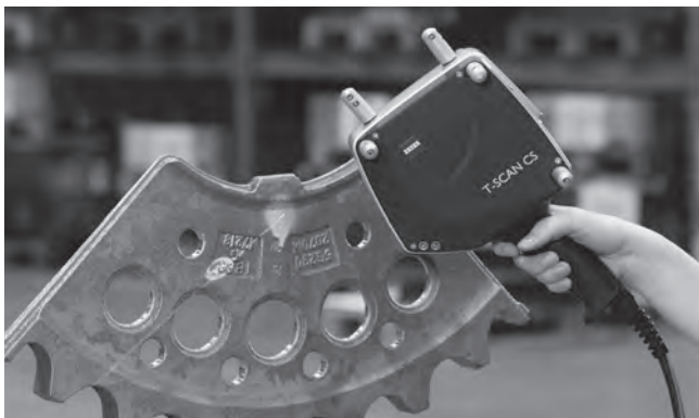
ZEISS T-SCAN: quick and intuitive 3D data capture with the hand-held laser scanner

Fast, intuitive and highly precise 3D scanning has taken on a new dimension in coordinate measurement technology with the hand-held laser scanner ZEISS T-SCAN CS. The revolutionary and modular all-in-one concept, includes perfectly matched components (tracking camera, hand-held scanner and touchprobe), thereby offering highest flexibility for a large variety of applications. The high-performance software platform colin3D ensures a consistently efficient and project-oriented procedure during the entire measuring process.