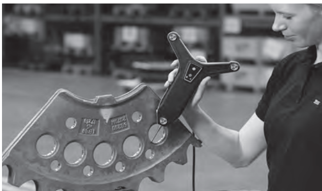
Hand-held touch probe ZEISS T-POINT - the ideal portable coordinate measurement machine for easy single point measurements

Outstanding technical features, e.g. the high dynamic range for data acquisition on various object surfaces, and a hitherto unseen data rate allow for an unparalleled scanning speed and precise measurement results.